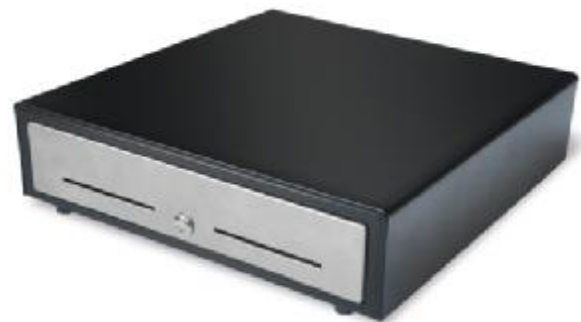
Stainless steel drawer front