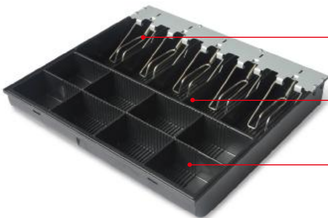
Durable Metal Wire Gripper Bill Holder Tested over one million operations